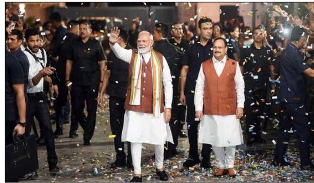
Prime Minister Narendra Modi greets (BJP) workers at the party headquarters in New Delhi on Tuesday.

and the National Conference-Congress alliance blanked out opponents in Jammu and Kashmir's first assembly elections in a decade and first as a Union Territory, marking a significant verdict with national ramifications. The results of the assembly elections – the first since the Lok Sabha polls this summer – buoyed the BJP ahead of crucial contests in Maharashtra and Jharkhand