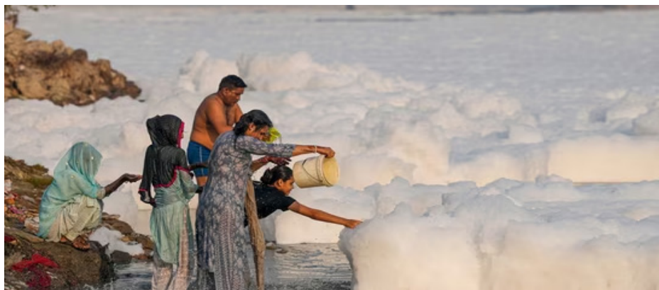
Yamuna river covered in toxic froth ahead of Chhath Puja

Trump also made a bold claim that he would end the war in Ukraine before his inauguration in January 2025, if elected.