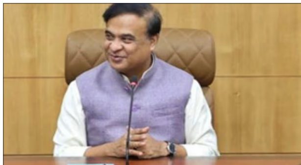
CM Himanta Biswa Sarma in a conference

He emphasized the importance of celebrating Assamese and other languages of the state, encouraging citizens to join in the festivities and honour the rich linguistic heritage of Assam. Assam Chief