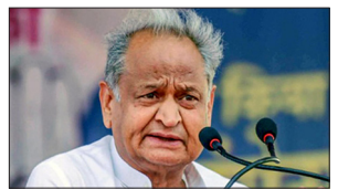
Former Rajasthan CM Gehlot

"Our government organised inflation relief camps and launched as many as 10 relief schemes for the public. Mr. Modi 'guaranteed' during the [2023] Assembly election that these schemes would continue, but the BJP government is proving these guarantees