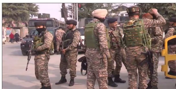
Visuals where Encounter erupts in Srinagar's Khanyar area

With this, the government will not have to send names to the Union Public Service Commission (UPSC) panel for the appointment of the state police chief. "The objective of the Appointment Rules, 2024 is to establish an independent and transparent mechanism. (PTI)