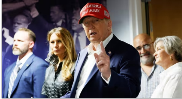
Donald Trump was backed by billionaire Elon Musk

Trump, who was backed by billionaire Elon Musk, exited the White House four years back after losing the elections to Democratic rival Joe Biden. In 2024,