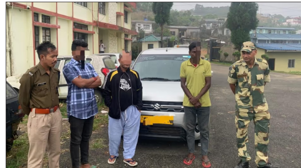
BSF, police nab two Bangladeshi in cross-border infiltration attempt