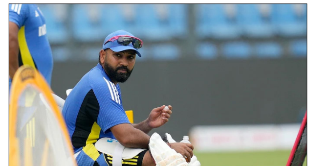
Rohit Sharma scored just 91 runs in three Tests vs New Zealand at home

Questions have been asked about Virat Kohli and Rohit Sharma's places in the Test side after India were whitewashed 0-3 by New Zealand on Sunday. Both the senior professionals failed consistently in the three Tests, struggling against pace and spin. Virat Kohli managed just 93 runs