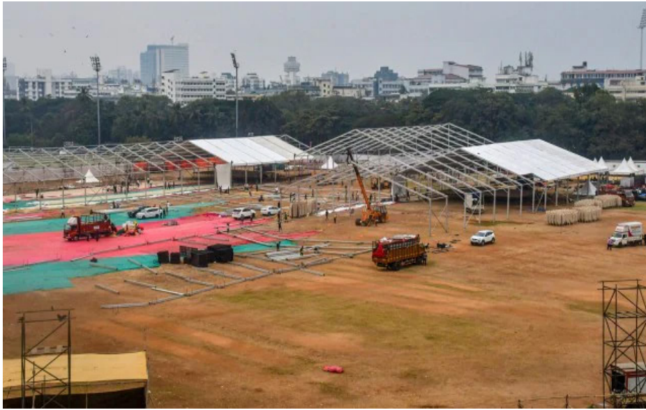
Preparations are underway for the oath-taking ceremony of the Maha Yuti government, scheduled for December 5, 2024, at Azad Maidan in Mumbai