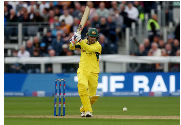
Third One Day International - England v Australia - Riverside Ground, Chester-le-Street, Britain - September 24, 2024 Australia's Alex Carey in action

His role in India's victorious U19 World Cup campaign in 2008 remains a career highlight. Under Virat Kohli's captaincy, Kaul led the bowling attack with 10 wickets, becoming the tournament's leading pacer for India.