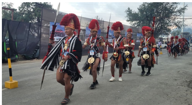
Nagaland's Hornbill Festival

The Hornbill Festival, often referred to as the Festival of Festivals, is celebrat-