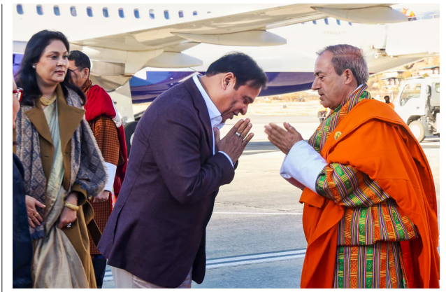
Assam CM Himanta Biswa Sarma in Bhutan on official visit

After completing all legal procedures, the five accused were forwarded before the Belonia District and Sessions Court.