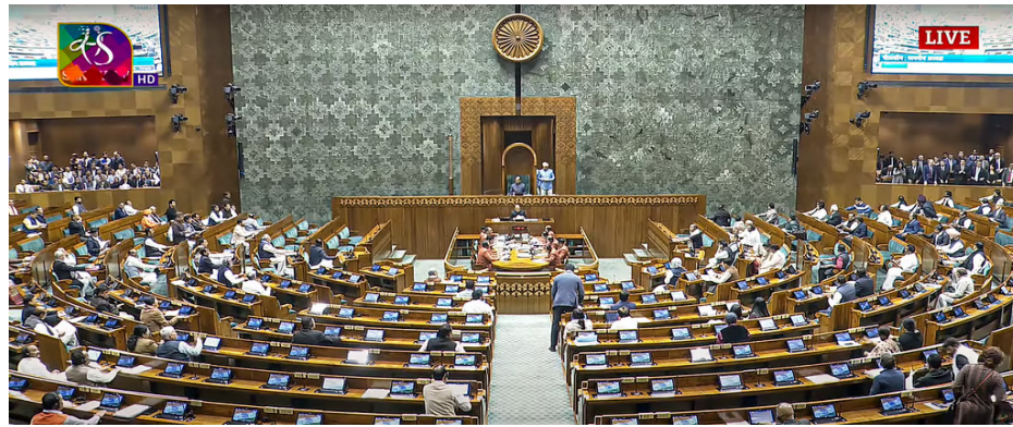
Speaker Om Birla conducts proceedings in the Lok Sabha during the Winter session of Parliament in New Delhi, on Tuesday, Dec 17, 2024

"NTA will be limited to conducting only entrance exams for higher education and will not conduct any recruitment exams from