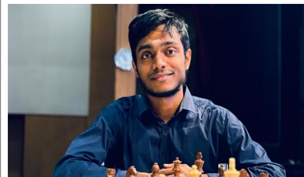
Aravindh Claims Victory Over Nakamura

New York: Indian grandmaster Aravindh Chithambaram sparked a big upset over number three chess player in the world, Hikaru Nakamura, with a win over the American grandmaster in the third round of the World Blitz Championship being held in New York.