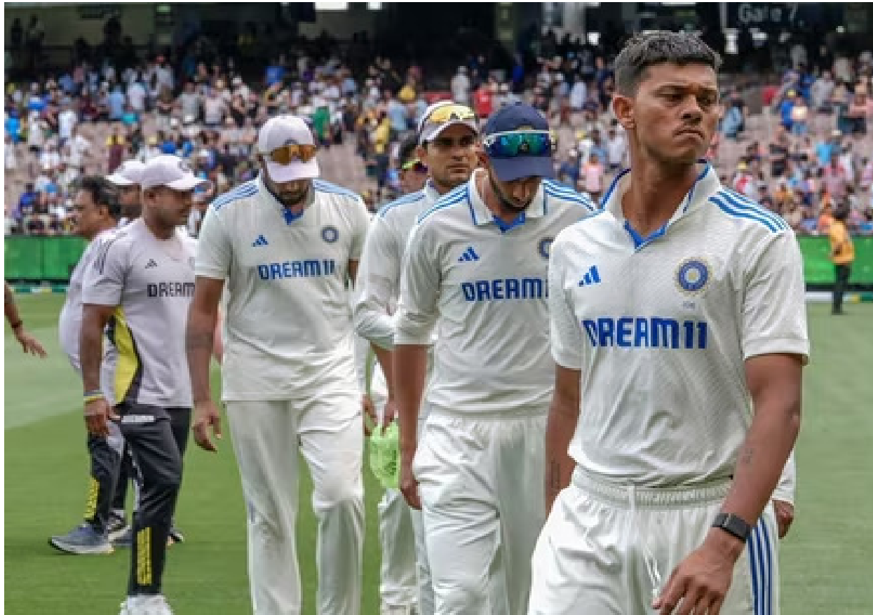
Indian players walk off the field after losing the fourth test against Australia at the Melbourne Cricket Ground in Melbourne, Australia on Monday. Australia won by 184 runs to take a 2-1 lead the five-match series.