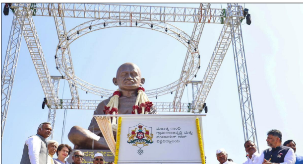
Karnataka CM and others leaders unveil Mahatma Gandhi's statue

Belagavi: Karnataka Chief Minister Siddaramaiah on Tuesday said Mahatma Gandhi was a diehard Hindu and the Congress believes in "Gandhi's Hindutva".