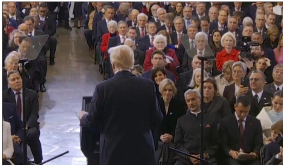
EAM Jaishankar represented India at the inauguration ceremony of Donald Trump as US President

The actor reached Lilavati Hospital at 3 am on Thursday and had been admitted there since.