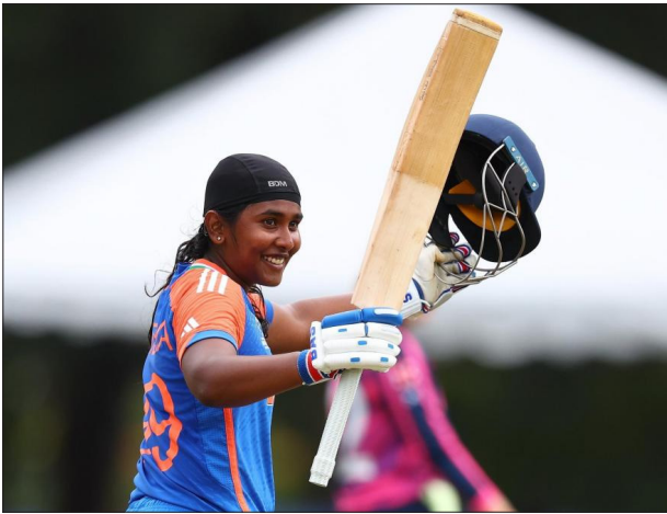
India's Trisha hits historic first-ever century in U19 Women's T20 World Cup.