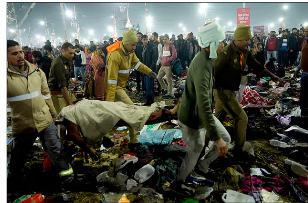
Rescue operation underway after a stampede occurred on 'Mauni Amavasya' during the ongoing 'Maha Kumbh Mela' festival.

While talking to reporters aboard Air Force One, Trump was asked "Did he (Modi) agree to take illegal immigrants. "He (Modi) will do what's right. We are discussing," said the president.