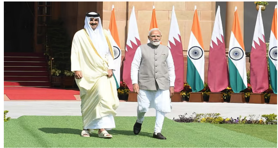
Qatar's Sheikh Tamim meets PM Modi and President Murmur in Hyderabad House

Ramesh also highlighted the Congress party's long-standing call for a reformed GST system, termed "GST 2.0," which would simplify the tax structure and improve compliance. The Congress party believes that Trump's reciprocal tariffs could undermine the GST system, which is designed to tax imports but not exports.