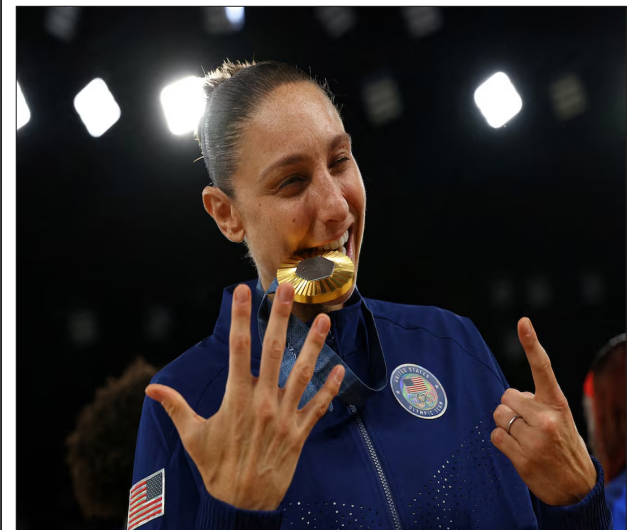
Paris 2024 Olympics - Basketball - Women's Victory Ceremony - Bercy Arena, Paris, France - August 11, 2024. Diana Taurasi of United States celebrates her sixth Olympic gold medal after 2004, 2008, 2012, 2016 and 2020, the most Olympic gold medals by a United States basketball player.